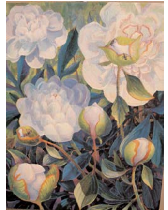
© Acrylic Painting by Artist/Instructor Beverly Mitchell

A variety of subject matters may be explored in this class. Materials List: Paints - bring what you have. Suggested Colors for Watercolor or Acrylic Paints include - Cadmium Yellow Light, Orange and Red Light, Permanent Rose, Dioxide Purple, Sap or Hookers Green, Cobalt or Ultramarine Blue and Phthalo or Prussian Blue. 1 Container for water, paper towels, drafting tape (thin width). Watercolor paper (block or sheets) 140 lb. Arches or Winsor Newton. (No Strathmore paper brushes (natural & synthetic) and watercolor palette. For Acrylic painters please bring your canvas and acrylic palette with appropriate brushes.