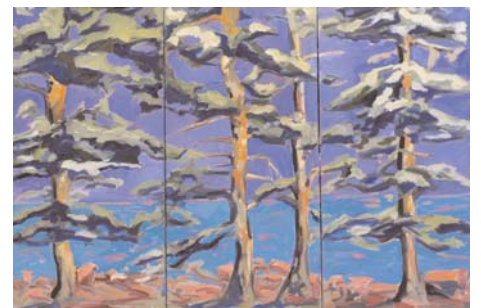
© Oil Painting by Artist/Instructor Lully Schwartz

Some drawing experience is required for this class. Materials List: Original sketches, images or photos to work from. Palette: wood, paper or plexi. 2 prepared canvases (no cardboard canvas panels). Suggested palette: Ultramarine Blue, Alizarin Crimson, Cadmium Yellow Light, Cadmium Red Deep, Burnt Umber, Yellow Ocher, Titanium White, Cerulean Blue, and Rose Madder. Variety of Hogs Hair and synthetic oil painting brushes in brights & filberts sizes 6, 8, 10, 12 & one round synthetic size 4. Angled palette knife, paper towels, low odor turpoid and trash bags (for carry out trash).