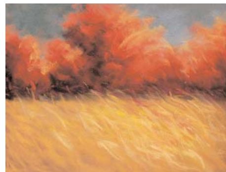
© Pastel by Artist/Instructor Karen Jones

In this class we will explore the use of strong color and contrast. We will begin with a still life using charcoal and chalk and work our way up to color pastels where we will experiment with different techniques to achieve a variety of effects. We will use large-format drawing or pastel paper to loosen up and will concentrate on 'making marks' to create dramatic statements. Some experience recommended. Materials List: 11 x 14" - 20 x 24" drawing/pastel paper w/clip, charcoal sticks, white and gray chalk, (graphite if you'd like), kneaded eraser, pastels with strong light and dark colors. Old shirt or cover-up, nubs for fingertips and hand wipes. One drop cloth approx. 1.5 yards sq.