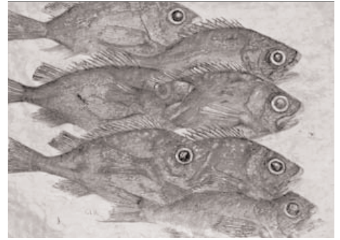
© Print by Artist/Instructor Gail Boucher

Fish Printing is a Japanese art form called Gyotaku. This involves inking or painting a real fish and printing it on rice paper. After this printing process has been achieved, artists can render the print with watercolor pencils depending on their choice. The fish can be done singularly or multiply in layers. The mediums are water based (ink, acrylic or watercolor). Fish specimens will be provided.