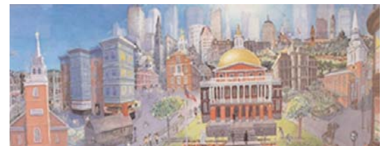
© Painting by Artist/Instructor Beverly Mitchell

Students will be shown new ways of seeing that will enhance their drawing abilities with Concentration on color and design using watercolor. Have fun and learn about fine art. $5. Materials fee to be collected by the Instructor at the first class.