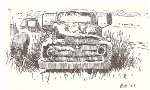
© Drawing by Artist/Instructor Alan Bull

Sharpen your ability to see and draw from life! All levels encouraged to apply. Materials will be provided.