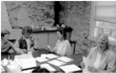
Volunteers help out with the Capital Fund Drive mailing.

NAA has received five grants for the new Laura Coombs Hills Gallery and other building improvements. This community support is vital to the success of this important project, and NAA is deeply grateful. The grants were: $35,000 from the Mary Alice Arakelian Foundation; $10,000 from the Institution for Savings Charitable Foundation; $10,000 from the Patterson Hale, Jr. Charitable Foundation; $3,000 from the Newburyport Bank; and $1,000 from the Edward G. Molin Charitable Foundation. The project requires an additional $20,000, which will be raised from the Capital Fund drive for members and supporters of NAA.