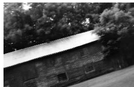
Honorable Mention William Tangorra, Newburyport, MA Country Drive Digital Photograph