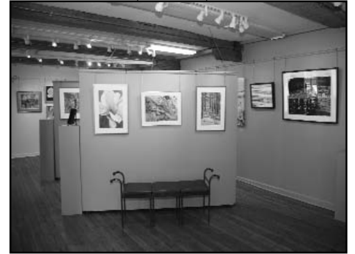
NAA's freshly painted galleries.