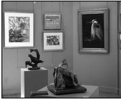
Faculty Show 2007

The public viewed our first annual Faculty Show which highlighted 16 of our talented faculty members and their art. The exhibition was met with rave reviews- students were inspired to continue on with their courses and visitors were encouraged