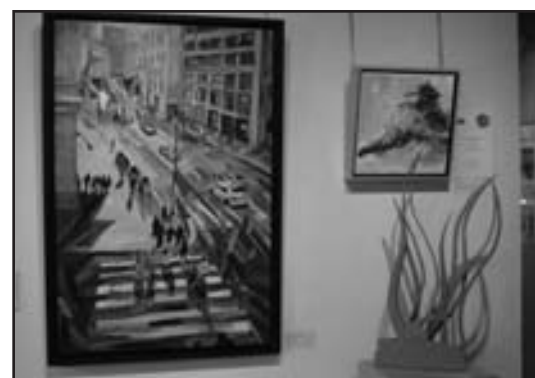
Winners are posted on the NAA website