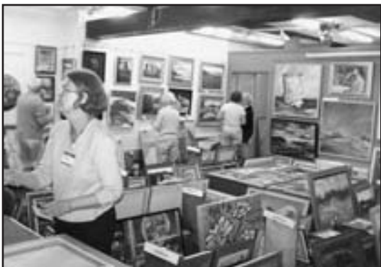
Volunteering on Jury day 2007, when more than 500 entries were received for the Regional Juried Show.