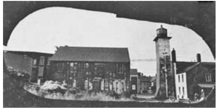
Rear of the NAA building in 1971 taken through a ship's railing. An oil storage tank is on the left, with the Newburyport Tanning plant in the background on Water Street, all parts of the industrial neighborhood.