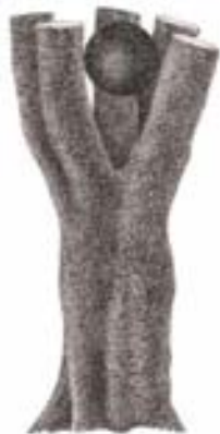
Tree & Ball Image By Barrie McDowell