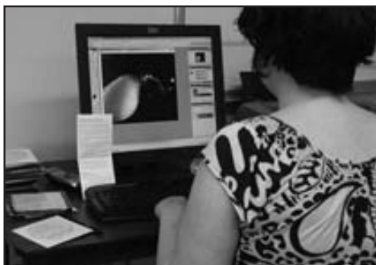
Reviewing Digital submissions in preparation for the 2008 The Regional Juried Show.