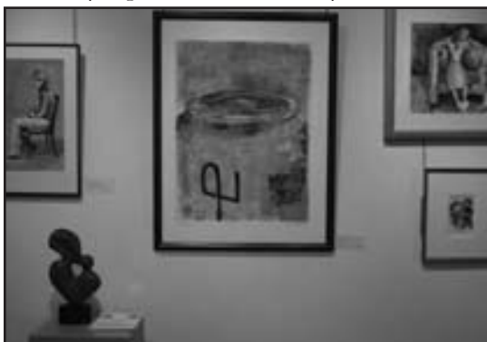
Member's Winter Juried Show III