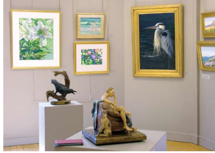
Laura Coombs Hills Gallery

Please visit www.newburyportart.org for a current schedule of NAA Shows and more information.